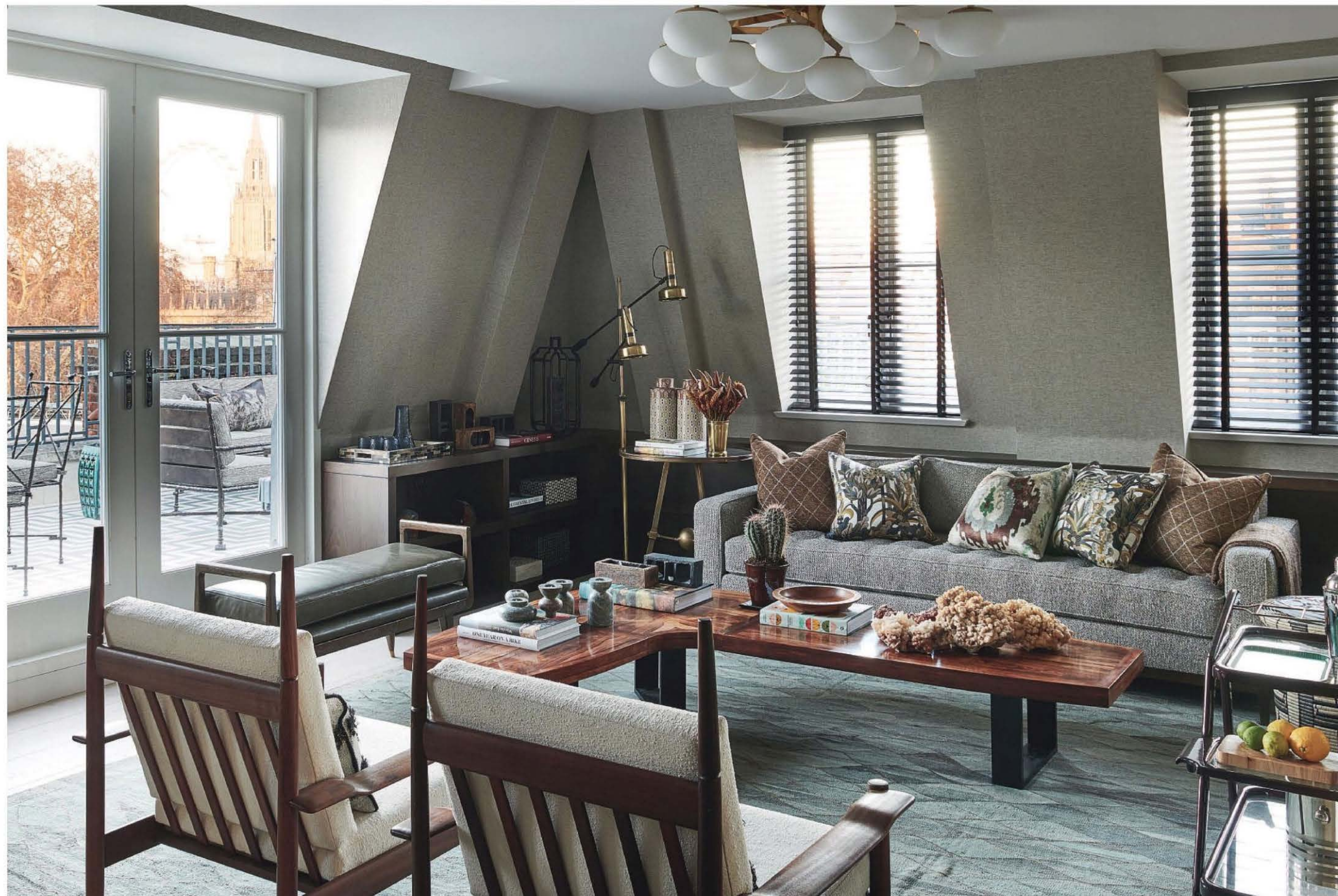
Living room A custom-made sofa by Hubert Zandberg Interiors, covered in 'Tilda' fabric by Pierre Frey, is paired with a mid-century rosewood coffee table and bar trolley. The leather-covered bench is by Julian Chichester and the two armchairs are vintage Danish designs Stockist details on p356 ►

'Our brief was to develop a new international style that is timeless, textured, contemporary and transportive,' says Hubert, who also channelled London's diversity and appetite for change when presupposing the personality of the apartment's potential tenants. 'This apartment is designed for a truly contemporary, culturally informed citizen of the world,' he explains. 'A modern bohemian if you will, who travels and collects, not necessarily physical objects but ideas and moods from the many places they visit.' The result is a mesmerising mix of artefacts, art, pattern, colour and exquisite furniture. Plus, it's possible to experience Hubert's unique take on the capital's character yourself as this home is available as a holiday rental. With such luxuriously edited surroundings, you may choose to stay indoors and tick off London's key sightseeing spots from the comfort of the terrace. hzinteriors.com