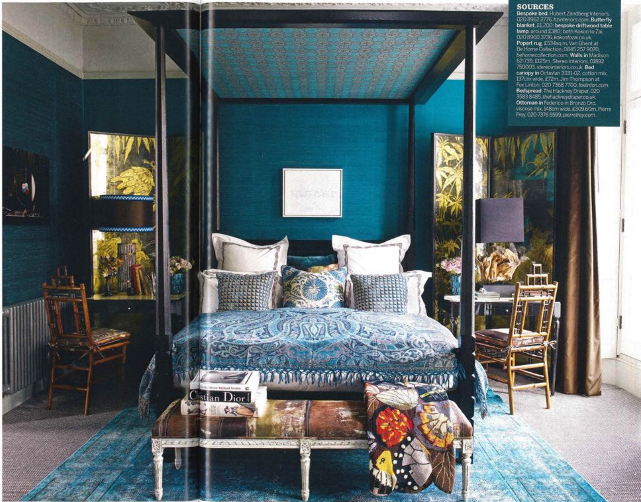
FEATURE: RACHEL LEEDHAM

FIND ALL THE LATEST SHOPPING BUYS FOR YOUR BEDROOM AT HOUSETOHOME.CO.UK/BEDROOM